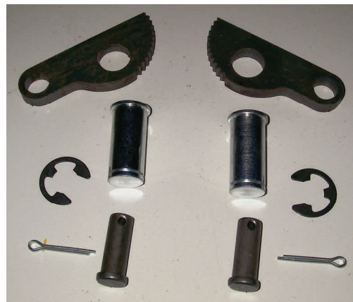
CA0006 kit for use with clevis link arms. JJ0300, JJ0400, and JJ0500 series models.