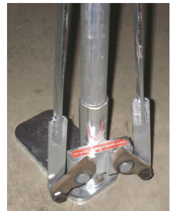
7. Straight link arms: Use bolt and nut to reattach link arms to jaws. Tighten nut with wrenches. Clevis link arms: Insert clevis pin through jaws and link arms. Insert new pivot pin through clevis pin.