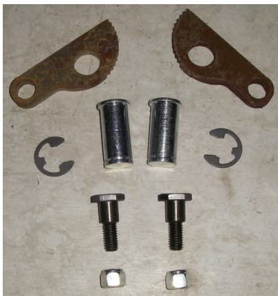
CA0010 kit for use with straight link arms. JJ0100 and JJ200 series models.

Tools required to replace jaws used with clevis link arms: medium size needle nose pliers, straight blade screwdriver, small mallet or hammer